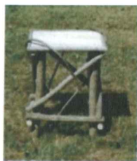
End Table or Plant Stand (1 1/2-2 hrs) $59