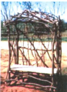
Bower (3 1/2-4 hrs) $385