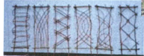
Trellis: Chain, Gothic, ZigZag, Rainbow, Curly, Diamonds, (not shown) Fan, Hearts -- you choose -- PLUS 1 tripod trellis (1 1/2-2 hrs for both)