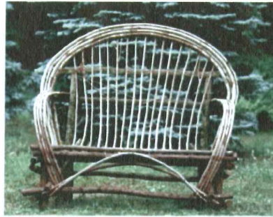
Loveseat (4 1/2-5 hrs) $385