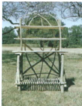
Baker's Rack/Potting Bench 1 shelf (3 hrs) $235 2 shelf (3 1/2 hrs) $275