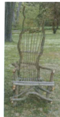
Sassy Chairs (3 1/2-4 hrs) $235