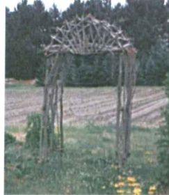
3 pc. Garden Arbor (3-3 1/2 hrs) $285