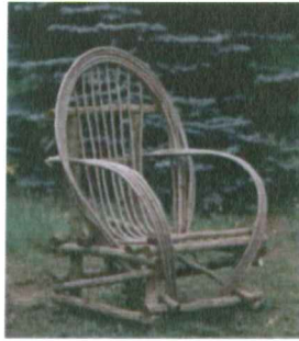
Chair (3 1/2-4 hrs) $265