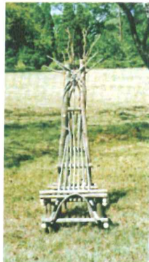
Ladderback Chair (2-2 1/2 hrs) $169