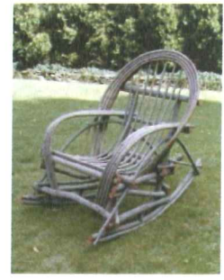
Rocker (4 1/2-5 hrs) $295